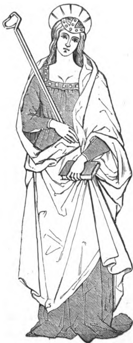
S. Agatha ( Malta, 15th century ).